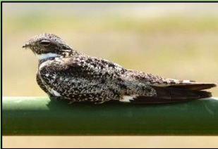
Common Nighthawk

Follow us on Facebook www.facebook.com/naturecalgary