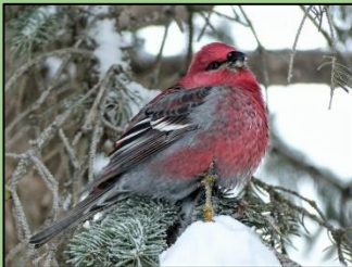
Pine Grosbeak male

NOTE: * in contact email addresses: remove when sending email.