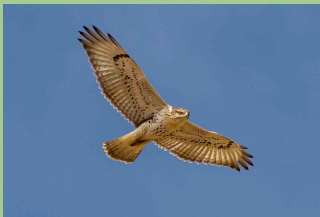
Ferruginous Hawk

Follow us on Facebook www.facebook.com/naturecalgary