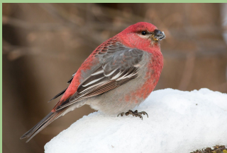
Pine Grosbeak

Deadline for the next Nature News issue is Mar 8, 2018.