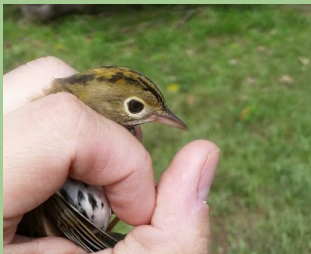
Ovenbird

Nature Calgary members can subscribe to Nature Alberta (quarterly magazine) for a reduced rate