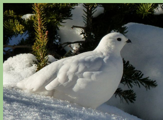
Willow Ptarmigan