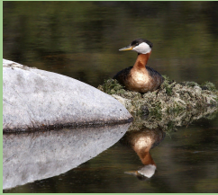
Red-necked Grebe

NOTE: * in contact email addresses. Remove when sending email.