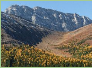
Larch ( Larix lyallii ) trees

Sun Oct 22, 8:30am: Bird Ann & Sandy Cross Conservation Area (ASCCA). Meet at the parking lot located at the south end of 160th St, 1.6 km. south of Hwy 22X. $2 required for sign-in. Bring a backpack with water, snacks, binoculars and camera. Dress for cooler weather! Register 5 - 7 days in advance by email or phone: contact Grant Brydle at jamesbrydle@shaw.ca or 403-720-4957.