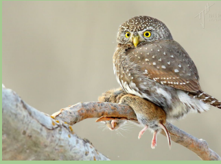
Northern Pygmy Owl

Volunteer Opportunities: contact volunteers*@naturecalgary.com for general inquiries; and Melanie Seneviratne ( melaniesene*@gmail.com or 403-815-1275) for the following: