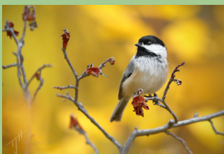
Chickadee

Impromptu walks: Just found a great site for a nature walk? Please contact our Field Trip Coordinator and let him know. Members are urged to be a facilitator of a trip. Note that a trip leader is a facilitator of trips . This involves selecting a site, and notifying the Field Trip Coordinator of the details of the trip. Remember to have participants complete the Nature Calgary waiver form.