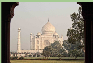
Taj Mahal

Directions: On Deerfoot Tr, take the EAST Glenmore Tr exit. After you cross the Bow River, take the next exit (18 St. SE) and head south. At the 5th intersection, turn left onto Quarry Park Blvd SE, and then left again into the parking lot for CARDEL. Cardel Theatre map at http://cardeltheatre.com