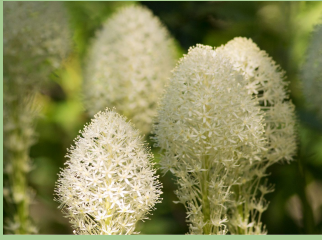
Bear grass

Thanks to everyone who participated in the June 24 Bus Trip. This year, 48 participants travelled by bus to Waterton National Park to take in its scenic beauty. Botanical highlights were the iconic Bear Grass and Yellow Angelica, which are only found in Waterton. Birds seen included: Osprey, Black terns, Hermit's thrush and Yellow-throated warbler.