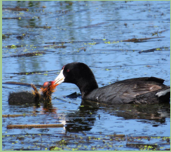
Coot with chick

NOTE: * in contact email addresses. Remove when sending email.