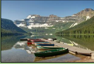
Cameron Lake