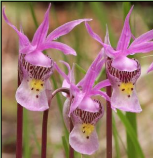
Calypso bulbosa var. americanus

Follow us on Facebook www.facebook.com/naturecalgary