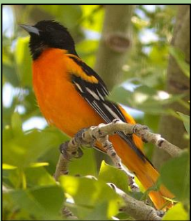
Baltimore Oriole

Please contact Ian at fieldtrips*@naturecalgary.com if you can suggest or lead a trip.