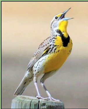
Western Meadowlark, ©Stephen Spring

NOTE: * in contact email addresses. Remove when sending email.