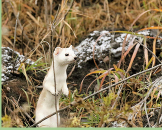
Long-tailed Weasel by Stephen Spring

NOTE: * in contact email addresses. Remove when sending email.