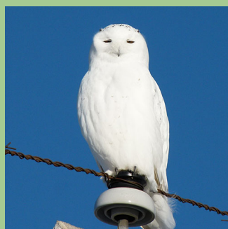
Snowy Owl by Val Scholefield

Nature Calgary members can subscribe to Nature Alberta (quarterly magazine) for a reduced rate