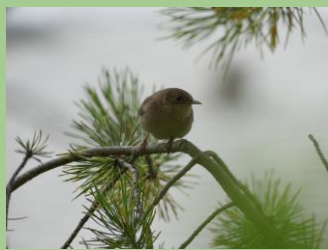
House Wren - Carburn Park

NOTE - * in the email addresses Remove when sending an email