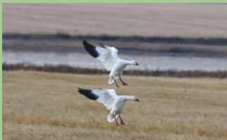
Snow Geese

Follow us on Facebook www.facebook.com/naturecalgary