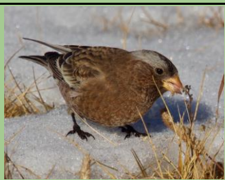
Gray-Crowned Rosy Finch Lower Kananaskis Lake

of the dinner, as well as contributing to Nature Calgary and Bird Studies Canada. (Bird Studies Canada no longer collects a $5 fee for the count). To donate: before the count, please send a cheque to Nature Calgary, P.O. Box 981, Station M, Calgary AB T2P 2K4. Mark the cheque "Donation for Christmas Bird Count". Donations over $20 will receive an official CRA tax receipt. You may also donate online; please include in "Special Instructions for Seller" that it is for the Christmas Bird Count. You may also bring your donation to the supper.