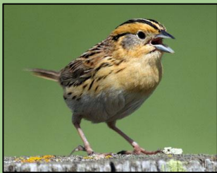
LeConte's Sparrow