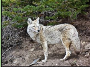
Coyote

Directions: On Deerfoot Tr, take the EAST Glenmore Tr exit. After you cross the Bow River, take the next exit (18 St. SE) and head south. At the 5th intersection, turn left onto Quarry Park Blvd SE, and then left again into the parking lot for CARDEL. Cardel Theatre map at http://cardeltheatre.com