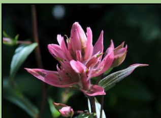
Indian Paintbrush on Many Springs trail

Annual Fall Banquet: Saturday, Nov 5: please see p.4