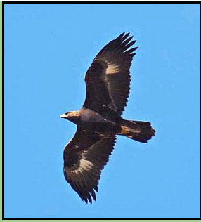
Golden Eagle