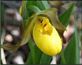
Yellow Lady Slipper ( Cypripedium parviflorum )

Volume 37, Number 8 http://naturecalgary.com