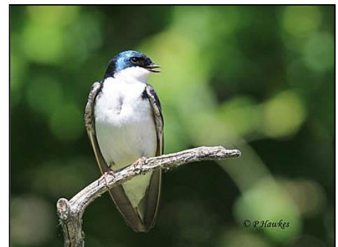
Tree Swallow