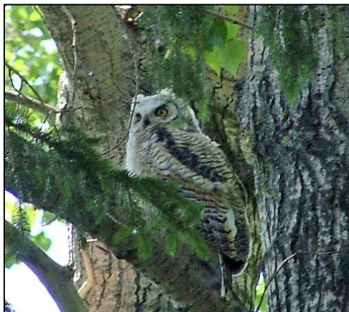
Great Horned Owllet