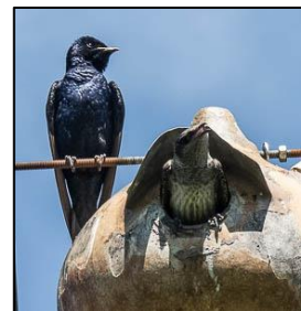
Purple Martin pair