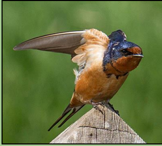
Barn Swallow

Note: Remove the *s in email addresses. They are used to discourage spam.