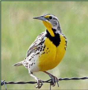
Western Meadowlark

2) Please turn in signed waiver forms to Nature Calgary, Box 981 Stn. M Calgary, AB, T2P 2K4, or at General and Bird Study meeting welcome tables.