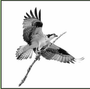
Osprey ©Kevin Stanwood

Volume 37, Number 7 http://naturecalgary.com