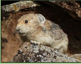
Pika