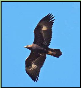
Golden Eagle

Mon Oct 10, Thanksgiving, 8:30am: Birding at the Ann & Sandy Cross Conservation Area (ASCCA). Go 1.6 km. west of the City limit on Hwy 22X, then turn left onto 160 St for another 1.6 km. Meet at the parking lot. $2 at sign-in is required. Register in advance, contacting Grant Brydle at 403-720-4957 or jamesbrydle*@*shaw.ca . Bring water, snacks, binoculars, camera, and rain gear.