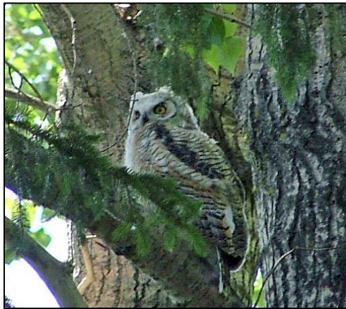
Great Horned Owllet