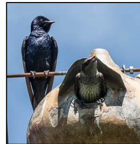
Purple Martin pair