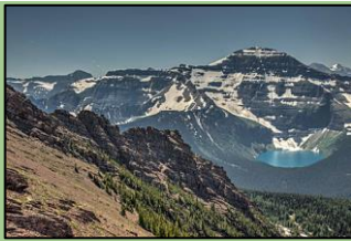
From Carthew pass