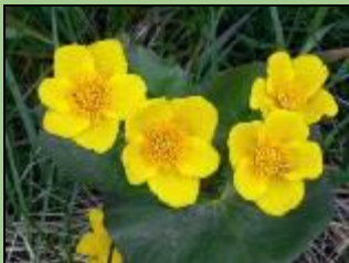
Caltha palustris (Marsh Marigold)