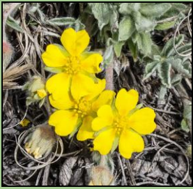
Early Cinquefoil ( Potentilla concinna )