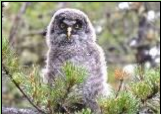
Great Gray Owllet

Note: Remove the *s in email addresses. They are used to discourage spam.