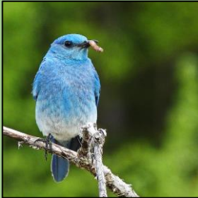
Mountain Bluebird

May 2016 email: president@naturecalgary.com