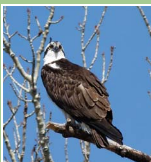
Osprey

http://groups.yahoo.com/group/Albertabird