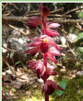
Striped Coralroot ( Corallorhiza striata)