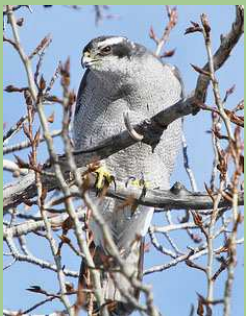
Northern Goshawk at FCPP