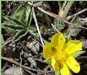
Potentilla concinna (Early Cinquefoil)