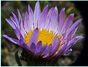
Parry's Townsendia

Volume 32, Number 1 http://naturecalgary.com