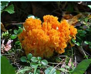
Coral fungus at Brown-Lowery Prov Park

Field trip leaders please turn in signed waiver forms to Nature Calgary, Box 981 Stn. M, Calgary, AB, T2P 2K4, or hand in at the General and Bird Study Group meeting welcome tables. Latest version of the waiver form is available http://tinyurl.com/NCform .