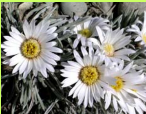
Hooker's Townsendia

Thank you, to the many talented photographers who have generously allowed their images to be used in Nature News and on the website!