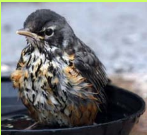
Juvenile Robin

Our speaker series will take a break for the summer and resume in September.