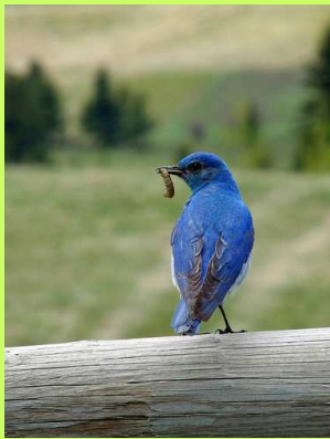
Mountain Bluebird

Non-board positions - Membership Promotion, Field Trip Leaders and Welcome Table Volunteers are always welcome - contact Jamie 403-243-7232 for details.