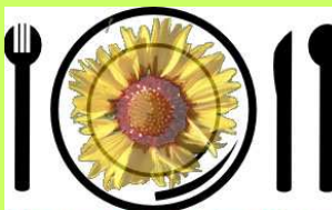
Nature Calgary Luncheon November 6, 2010

For details of these and other volunteer opportunities, email naturecalgary@cfns.fanweb.ca or see the volunteers' page at http://naturecalgary.com