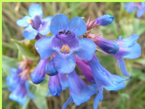
Penstemon nitidus