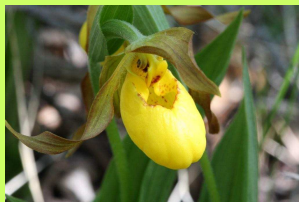
Yellow Ladies Slipper