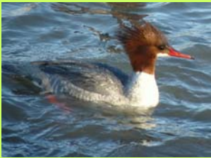
Common Merganser

Wed May 5: Montana Birding joint meeting with the Bird Study Group