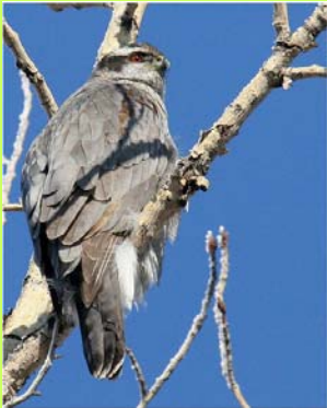
Northern Goshawk

or see the volunteers' page at http://naturecalgary.com