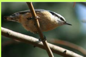
Red-breasted Nuthatch

Nature Conservancy of Canada Alberta Region Toll Free: 1.877.262.1253 www.natureconservancy.ca alberta@conservationvolunteers.ca