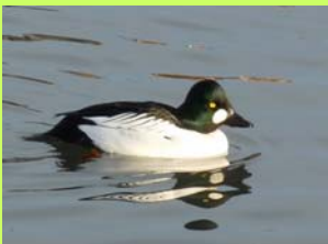
Common Goldeneye

Used binoculars wanted! Serraniagua Corporati , in Colombia, works to promote sustainable development, in part by teaching children about local birds and their habitat. Sadly, they only have a few pairs of binoculars to share-but you can help! Please call Jan at 403-275-1582 by March 27 if you have binoculars to donate.