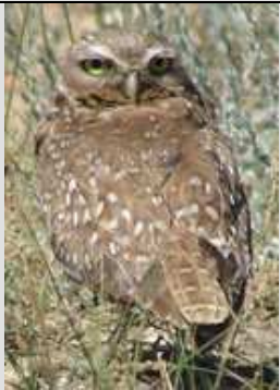
Burrowing Owl