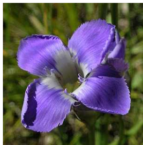
Gentiana crinita