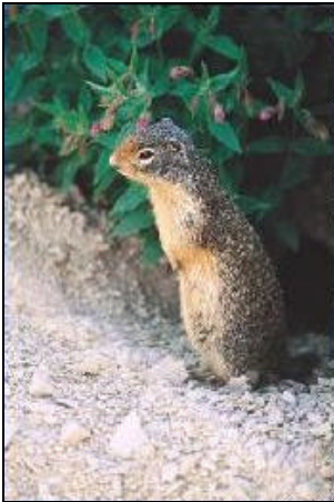
Richardson's ground squirrel

Please submit a list of bird species seen on trips to brooke@webfoundations.com