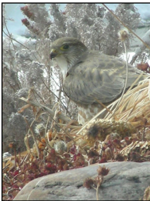
Merlin