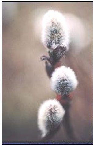
Pussy Willow

Join the Alberta Environmental Network mailing list www.aenweb.ca/lists