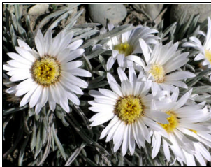
Hooker's Townsendia

CFNS & Inglewood 24hr Rare Bird Alert 403-221-4519 Updated Mon & Thu