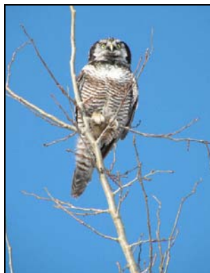
Northern Hawk Owl

Calgary May Species Counts: Sat/Sun, May 30/31. Find all the Birds, or Plants in bloom within 80km of Calgary. Everyone is invited to participate, whether beginner or seasoned pro. Participation can be for both days, 1 day or a 1/2 day. For Bird territories, contact Brian Elder, 403-374-1571, brianeld@telus.net . For Plants, contact Suzanne Visser, 403-288-0658, svisser@ucalgary.ca . If you are a past volunteer or a new one, please contact the coordinators to confirm your availability.