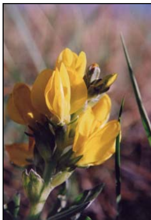
Golden bean

Nature Conservancy of Canada Volunteer Events www.conservancyvolunteers.ca