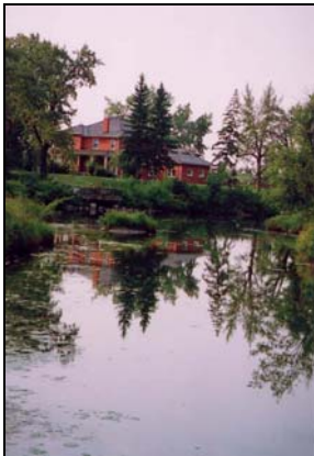
Colonel Walker House, Inglewood Bird Sanctuary