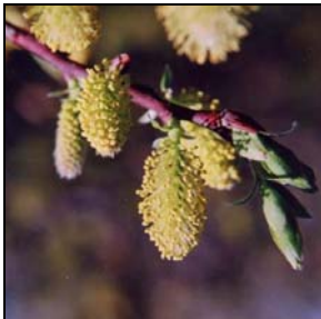
Willow salix

CFNS & Inglewood 24hr Rare Bird Alert 403-221-4519 Updated Mon & Thu